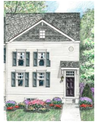
Optional items may be depicted.